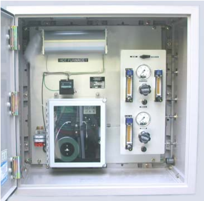
General Purpose Total Sulfur Analyzer